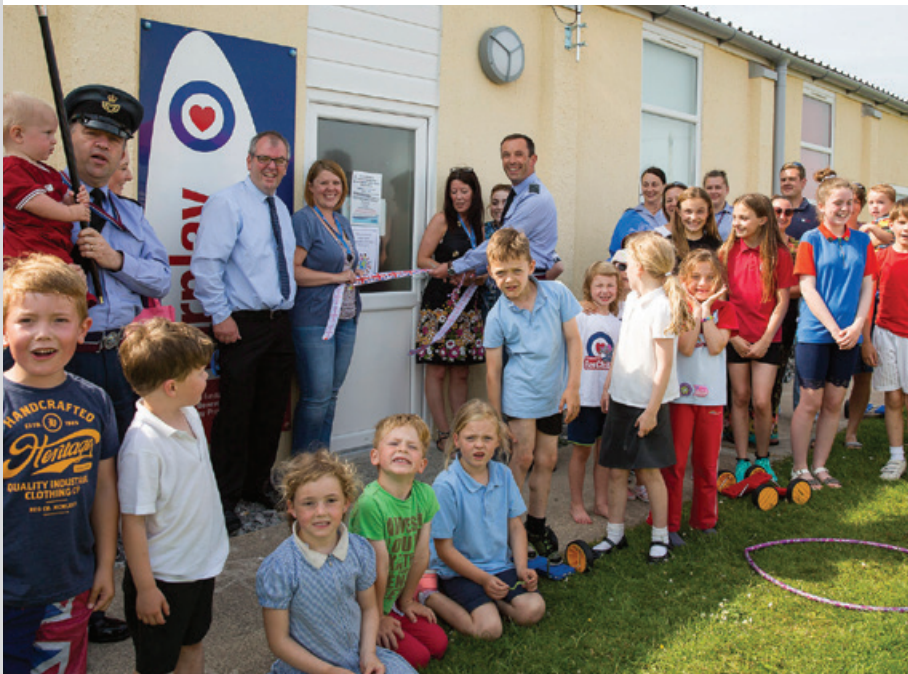
Official opening of the refurbished community buildings at RAF Valley with local school children.

At RAF Valley on the Isle of Anglesey, the Officer Commanding base Support and Officer Commanding Personnel Services Flight sit on the board of Governors at Ysgol y Tywyn – one of the station's local primary school. This helps build on the strong links between the Serving community and local school. Pupils from the school also regularly visit the station and access the gymnasium for sporting activities, allowing children to experience the facilities on offer and helping integration between the Armed Forces and local population. The station also organises family events throughout the year, helping families meet, engage and have fun. These include the annual Families day event, Station Halloween and children Christmas party events, as well as themed events in a number of locations across the station.